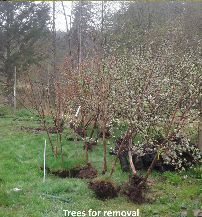
Trees for removal

On April 24th, the existing overhead watering system will be removed and the fencing rolled up for future use.