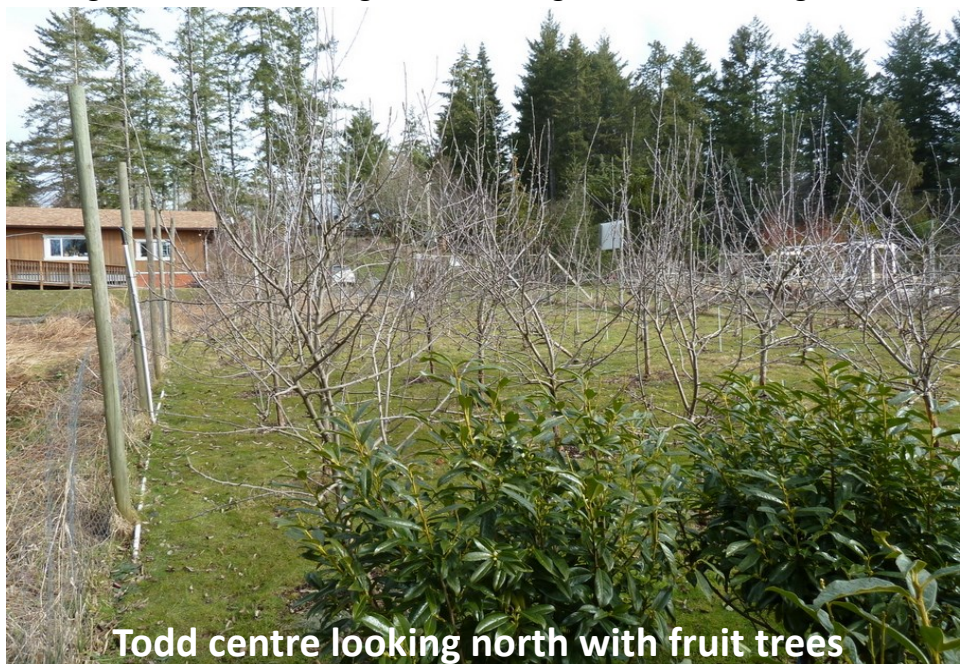
Todd centre looking north with fruit trees

Lots of progress for just two mornings' work means we can now see the cleared space and envision the completed project.