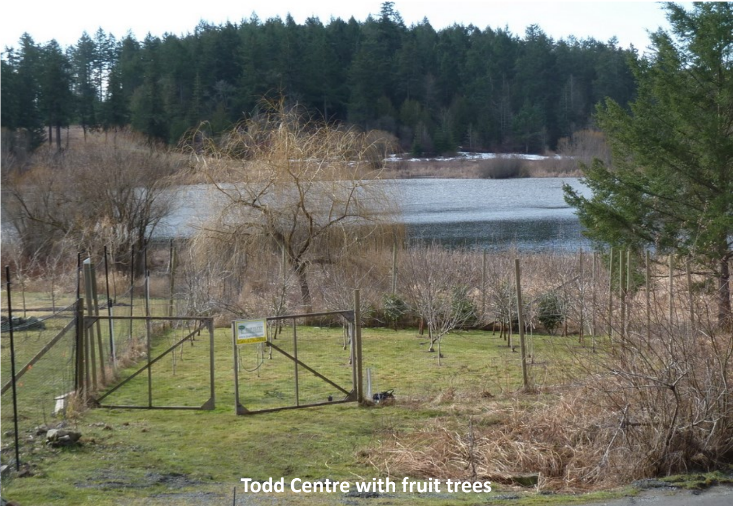
Todd Centre with fruit trees