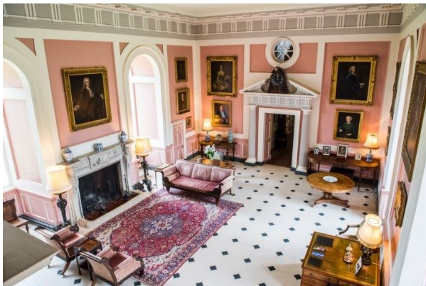
Picton Castle, Wales

What struck me most were photos of a most beautiful R. thomsonii with red flowers, white calyxes and leaves unmarked by distortions of grey or yellowish mildew, which gradually killed so many fine thomsonii rhododendrons here a few years ago. Britain's rhododendrons seem to have developed a resistance to mildew.