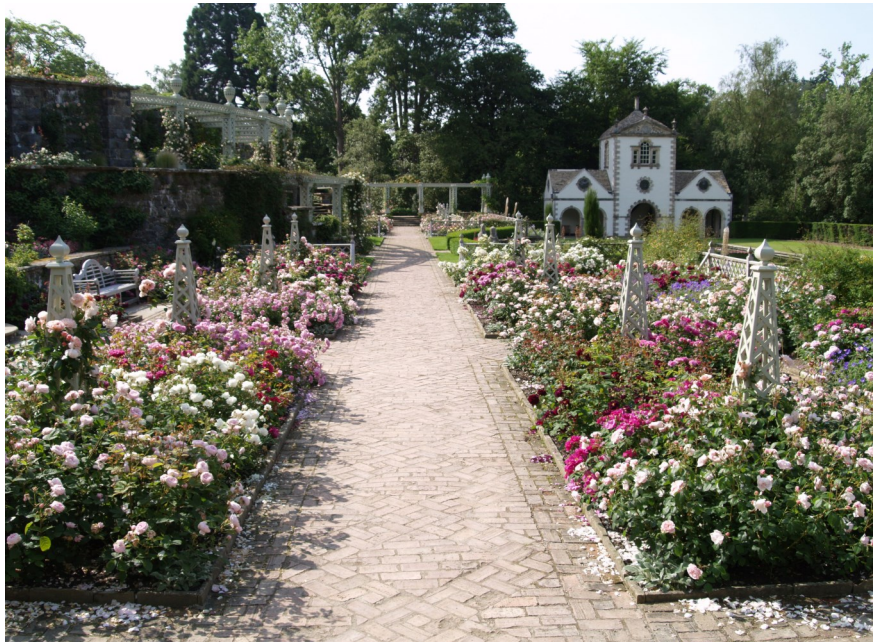
Bodnant Garden, Wales

I did not notice any photos of rhododendrons with notched leaves from our local bane, weevils. If there were some, Garth avoided photographing them.